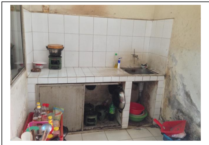
Above is the kitchen shared by the 8 students.