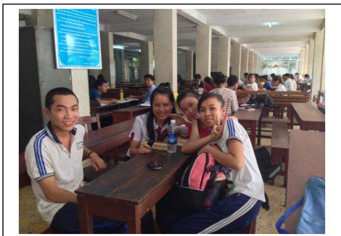
The common area is where students gather and study together. It is simple but clean.