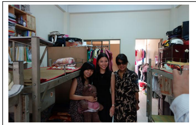
There are 8 students to one small dorm room, with 2 bunk beds on each side. Students consider themselves lucky if they get housing from the university.