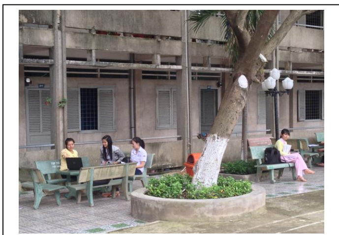
The courtyard is simple but peaceful. You can see more dorm rooms behind the students.