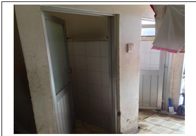
Left side is the shower room and right side is the toilet. Both are shared by the 8 students.