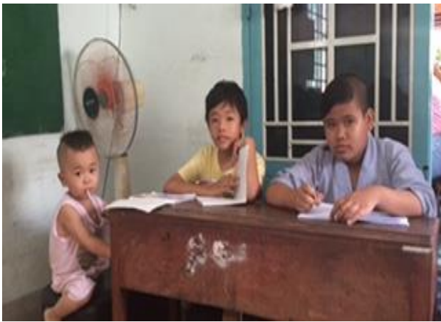
These students are extremely patient and hardworking. They also have amazing penmanship; look at a sample of their handwriting on right side.