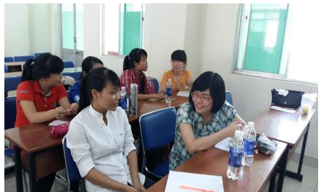
The students also got time to bond, which helps our goal of building an AMA identity and community.