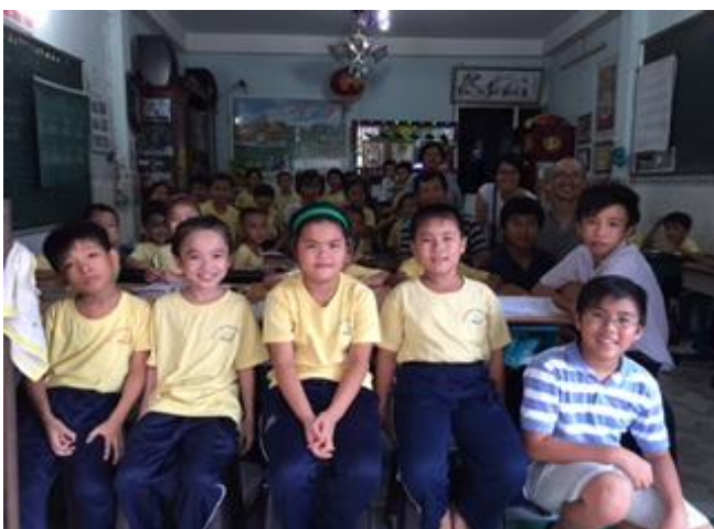
I love their focus and attitude. No one complains. They just do what they got to do in order to get educated and get ahead in life.