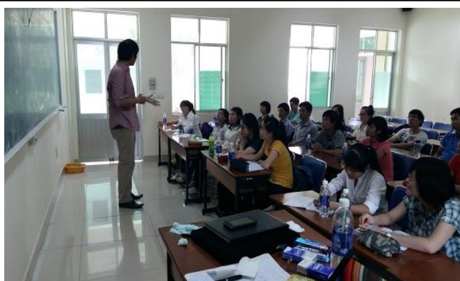
Training in session at the university campus.