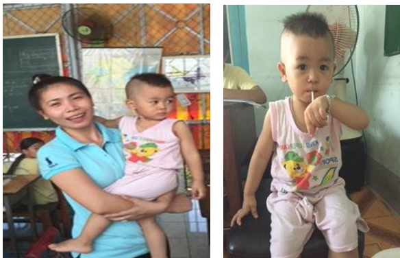
Like mother like child. She once grew up at this school, then returned as a teacher. Now, her child is growing up here with her.