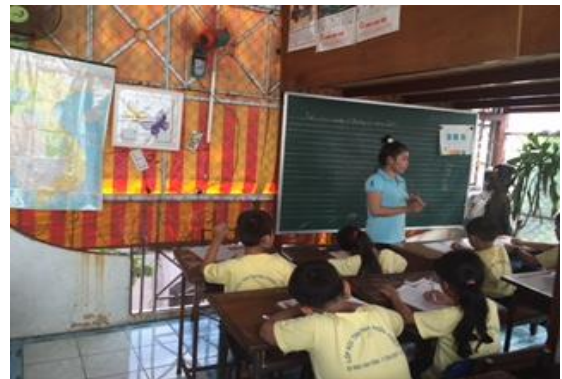
A class in session. Despite a hot and sweaty environment, these students stay focused on their work. She is a wonderful and loving teacher.