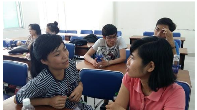
Classes thus far focus on practical topics and aim at developing the potential of these students and teachers.