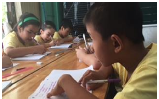
I watched this boy write over the same words in a sentence 4 times during a dictation test because his pen was running out of ink. Though the teacher already moved onto the next sentence or 2, he still managed to memorize and catch up. He works hard.